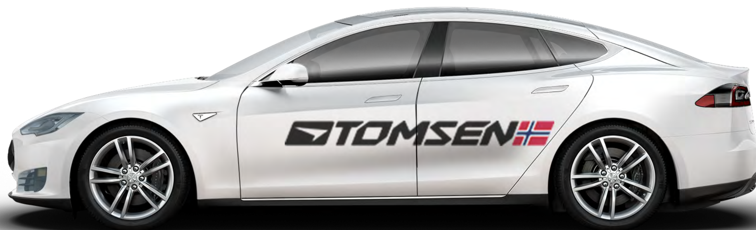
| 1X TESLA