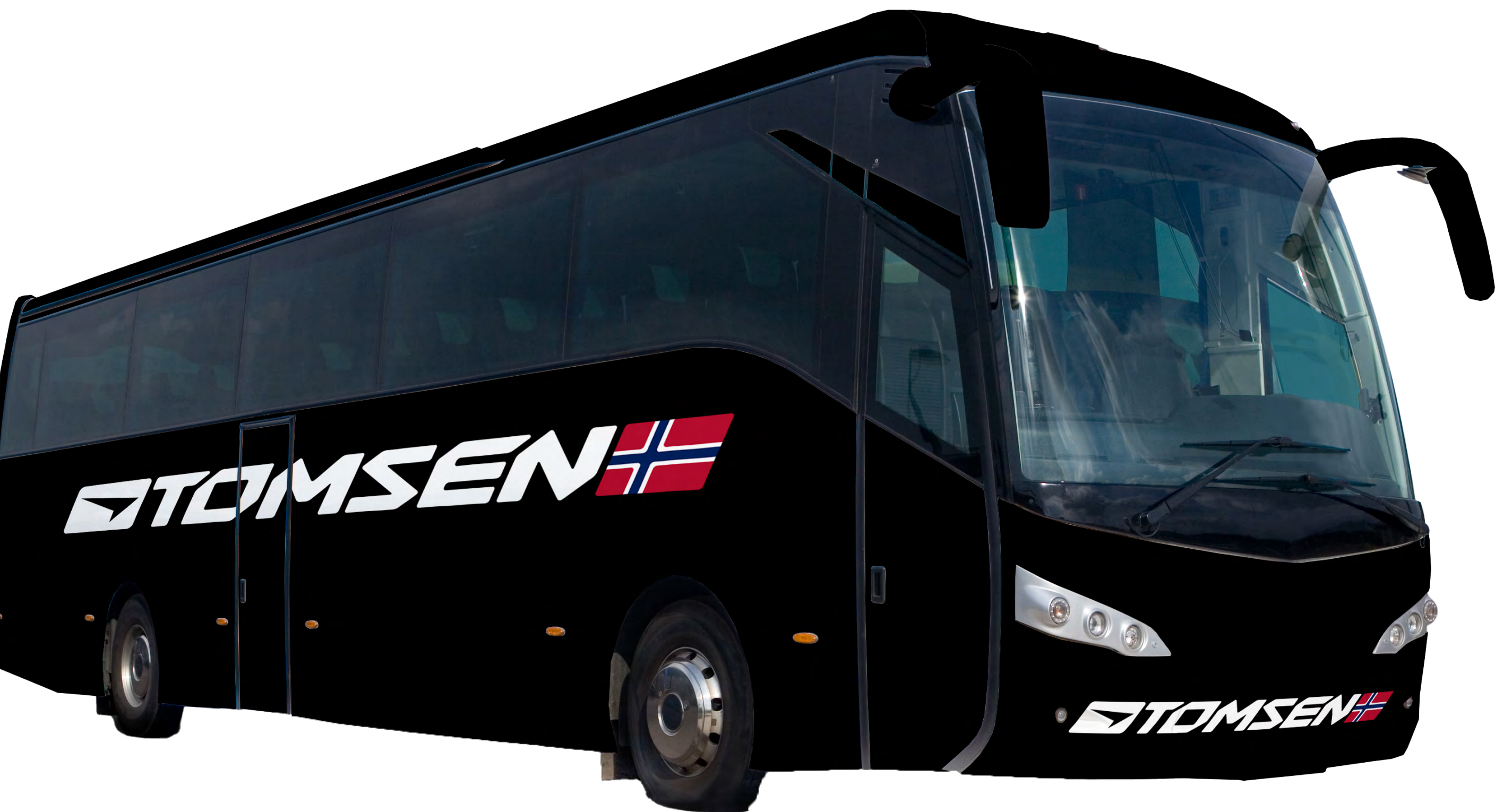
| 1X REGULAR BUS